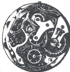
13L. ALPINA 890 — 2 PUSHERS — 30 MIN. REG.