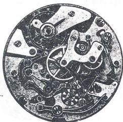
14L. EXCELSIOR PARK 8 — 2 PUSHER — 45 MINUTE REGISTER