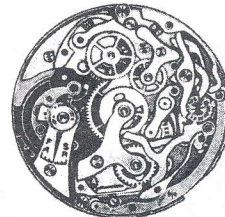
13L. BULOVA 13AH — 2 PUSHER — 30 MINUTE REGISTER