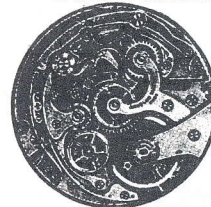
12L. ANGELUS 257 CALENDAR — 2 PUSHERS — 30 MINUTE REGISTER For Calendar Parts Use ANGELUS 255 in Calendar Section